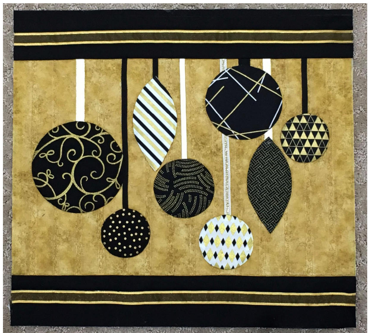
All layers (batting, backing and top) trimmed around the outside.

Start by squaring your project so the backings, batting and top are all trimmed to the same size. I use my Karen Kay Buckleyøs Perfect Adjustable Square \hat{I} . I build the acrylic pieces to the finished size plus seam allowance so trimming is accurate and a breeze. And, donøt let the name fool you, it can be built to rectangular sizes also.