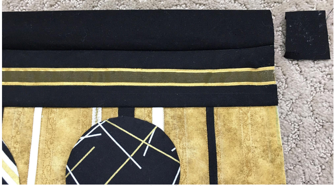
Excess trimmed after pressing.

3. First, press these strips, using steam. Press them flat and trim any excess along the outside edges.