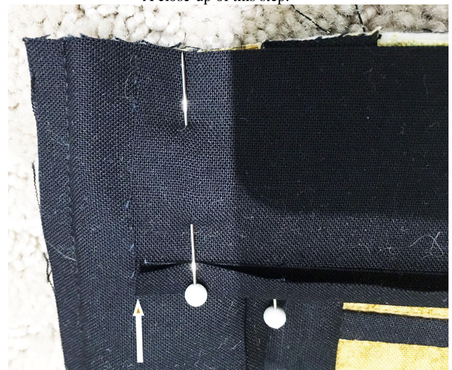
Arrow shows where strip ends.