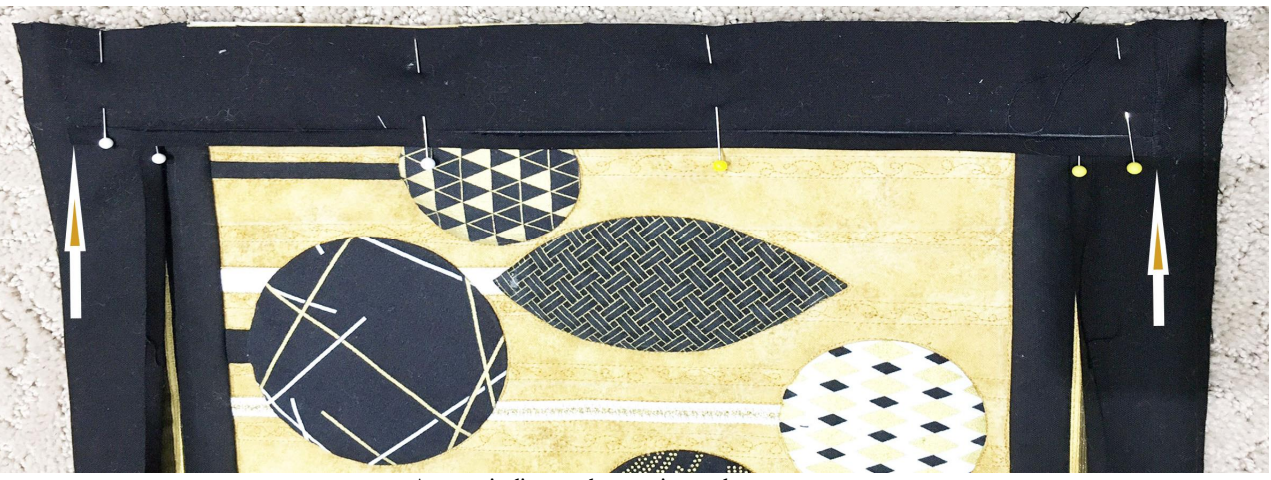
Arrows indicate where strips end.

6. Now, we@re ready for the side strips. Cut two strips 2ö wide by about 1ö shorter than the side. (This might sound odd but keep reading). Press ¼ö seam along one side following the pressing directions in step #1 above. Center and pin these strips, even with the raw edge of your project. They will be shorter than your finished project.