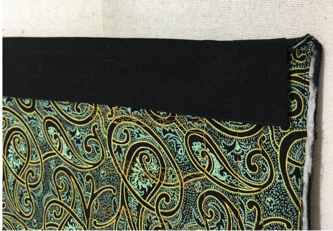
View from the back with side strips steamed in place.

8. Press these strips the same as in steps #3 and #4 above. First, press flat and then fold and steam press over the edge.