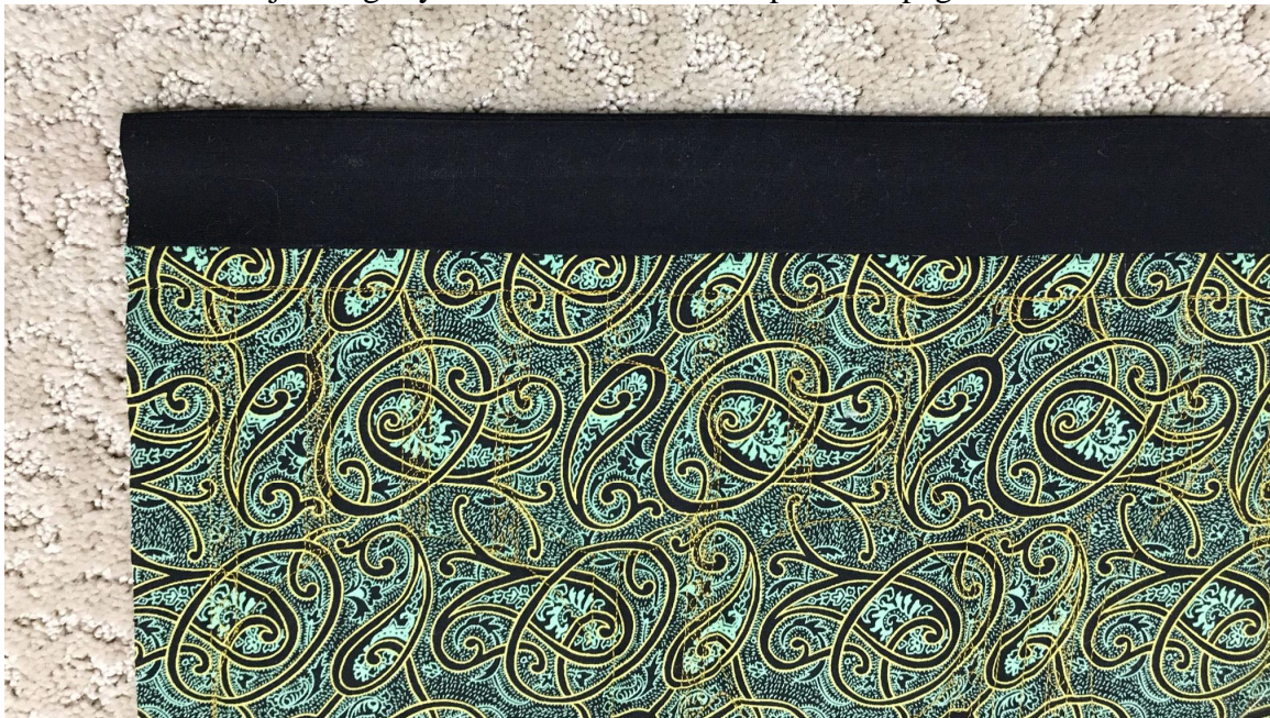
Strip steam pressed over back.

4. For the second pressing step, pull the strip towards the back and steam iron so the strip is not visible on the right side of your project. Ideally I like the seam right on the edge or just slightly towards the back. See photo on page 7.