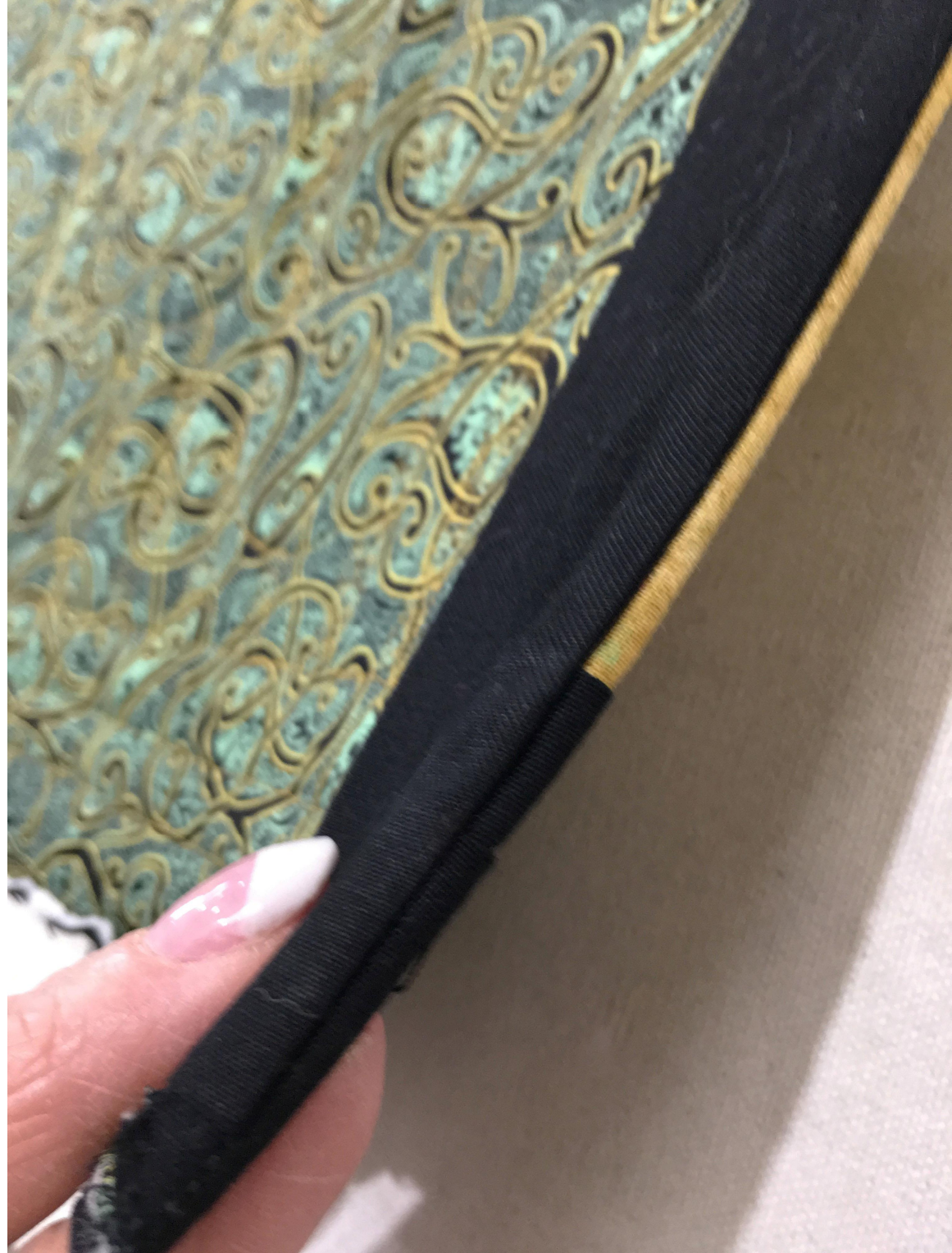
View from the side.

Pin the two side strips and appliqué along your ¼ö pressed seam.