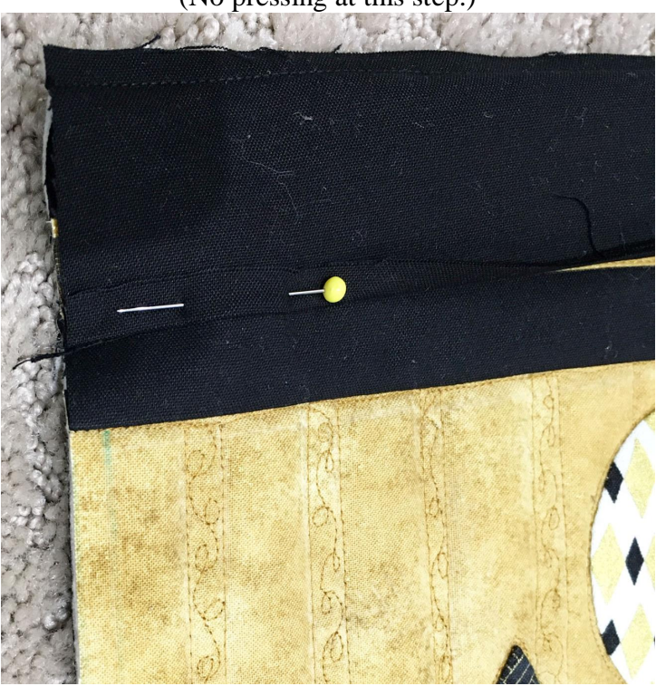
Strip pulled onto the front and pinned.

5. This might sound crazy, but, your next step is to fold those strips back to where you started, on the right side of the quilt. Pin them in place so they are nice and flat. (No pressing at this step.)